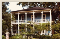
243 S. Jefferson Avenue

New ornaments and Christmas cards will be offered for sale, refreshments will be served, and transportation by our own Covington trolley will be provided.