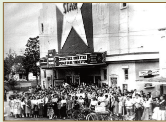
Star Theater in the late 1940's.