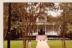
323 W. 19th Avenue