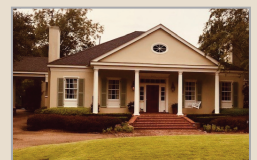
507 W. 20th Avenue

The date of the tour is Sunday, December 8 from 2-5 pm. Tickets will be available online and in a few local stores for $20. The money raised helps us give free and interesting programs on Covington’s unique heritage throughout the year. The History and Holly Tour is one of the most anticipated events during the Christmas season, so please join us on December 8.