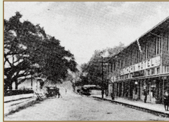
North New Hampshire Street looking at Boston Street. Note the oak trees on left.

Farm-to-table refreshments were prepared and served by Jerry and Cindy Mendow.