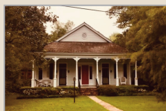
223 W. 19th Avenue