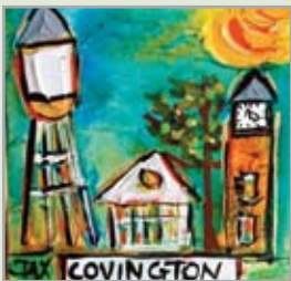
Image of CHF's first Christmas ornament