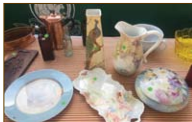
Some of the many consignment items from the Oxen Attic

of The Oxen Attic were mostly local merchants and members of the CHF who were looking to find new homes for their old treasures.