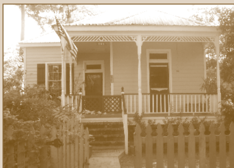
After - 901 West 25th Avenue

that has continued to this day. The house at 901 West 25th Avenue once again exudes charm as it did at the turn of the century. Over the next few years with the development of the rest of the block, their dreams came to fruition.