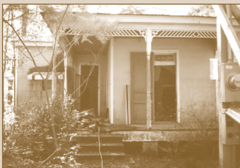
Before - 901 West 25th Avenue